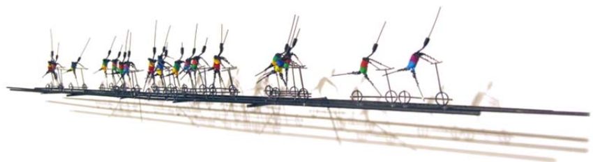
Frührentner, 2011 Draht, Ton 12 x 80 x 10 cm