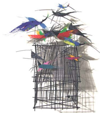
Dachdecker, 2011 Draht, Gewebe 28 x 20 x 18 cm

Anyone who immerses themselves thoroughly in his works realises how hypocritical and frankly subversive the stories they depict can be and how much human tragedy they express.