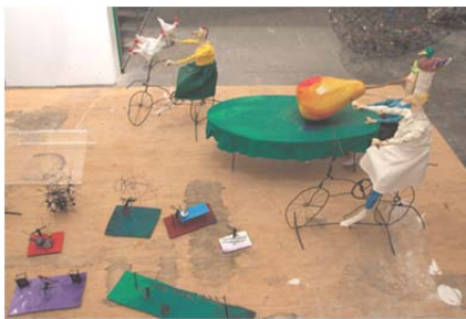
Ansichten aus dem Atelier